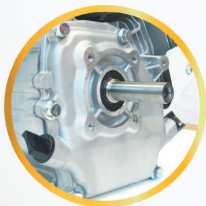
HZ-5010-19K (Key Type)

The heart of all Harz products. Those gasoline engines combine impressive performance with reliable stability. No matter what equipment they serve, you will never regret to trust them! From 2-Stroke to 4-Stroke, high power output to low emission models, they constantly shows high quality and strong vitality.