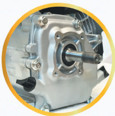
HZ-5010-19T (Thread Type)