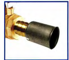
Polietileno Press-fitting Press-fitting polyethylene