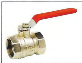
Palanca Roscar H-H F-F Threaded