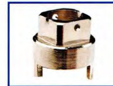
Cuadradillo Square handle