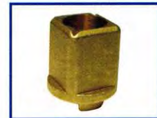
Cuadradillo Universal Universal square handle